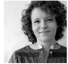
Lone Garde CED Denmark